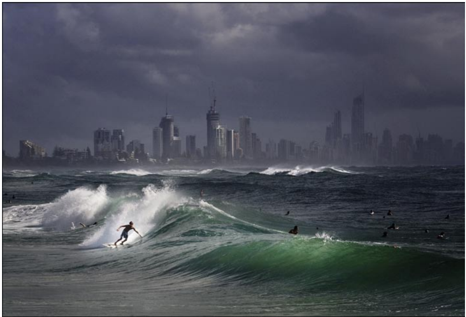
Top: Young Monk, Kyaukme [Selectors Award] Above Bottom: Surfing up a Storm [Best Projected Image] Top Right: Eloise [Selectors Award]