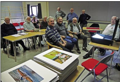
A view of the print judging room and the judges at the 2013 EAF Exhibition selection day.

On a happier note I recall my visit, a couple of weeks ago, to the PAGB Club PDI Championships at Warwick University Arts Centre. I have visited this event every year since I took on the post of EAF Competition Secretary in 1996 and always look forward to it. I love seeing the superb images from club members all over the country, and being there to support “our” teams.