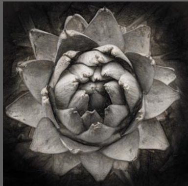
Artichoke by David Robinson ARPS

The SUFFOLK MONOCHROME GROUP are a select group of twelve, dedicated and highly experienced photographers whose aim is to enjoy and promote the art of monochrome photography in all its various forms. The subject matter on display is varied including landscapes, portraits, sport, abstract as well as images of other genres. Over 60 prints on display.