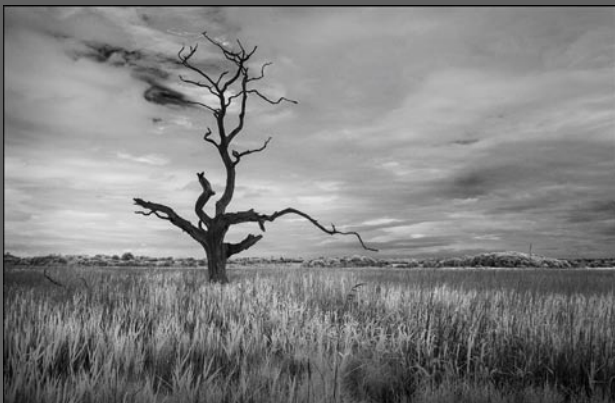
Dead tree and Reeds - Snape