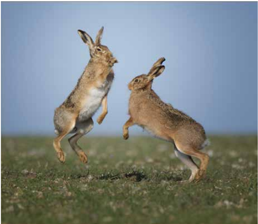
‘Boxing and Jumping’ by Colin Bradshaw DPAGB EFIAP BPE5* EPSA of PICO which was selected as the Best Projected Digital Image in the 2023 EAF Annual Exhibition.