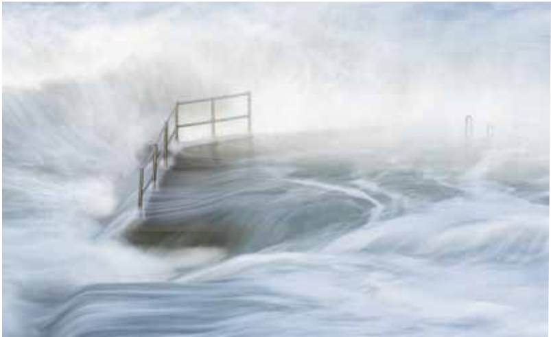
'Swamped' by Iain Houston of Welwyn Garden City PC which was judged Best Print of the Championship.