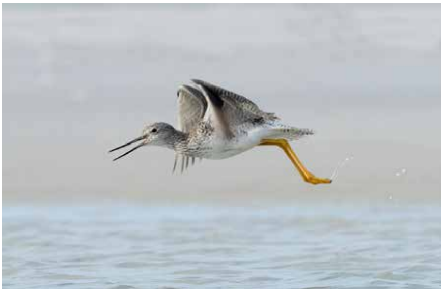
Below: 'Lesser Yellowlegs with water trail' by Judith Wells CPAGB of North Norfolk PS.