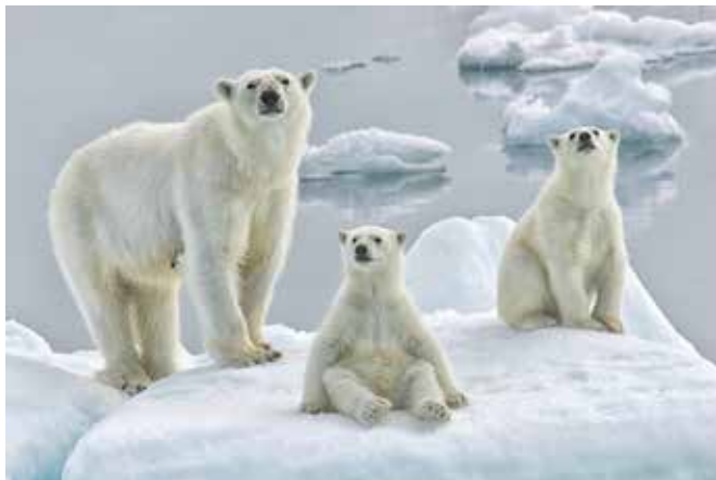
'Polar Bear Family Resting' by June Sparham of Welwyn Garden City PC which was selected as Best Image of the Championship.