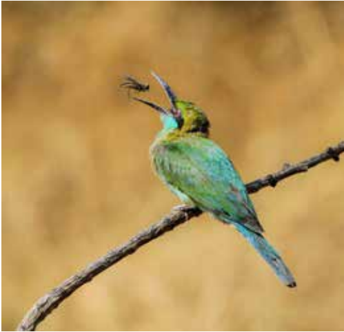
Left: 'Little Bee-Eater Sallying' by June Sparham DPAGB of Welwyn Garden PC.

Images from some of the successful Credit and Distinction submissions at the November 2021 adjudication are reproduced on the next three pages.