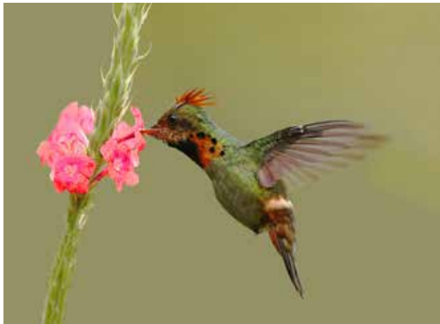
'Right: Image no. 9' by David Pelling LRPS CPAGB from Wy- mondham PS.