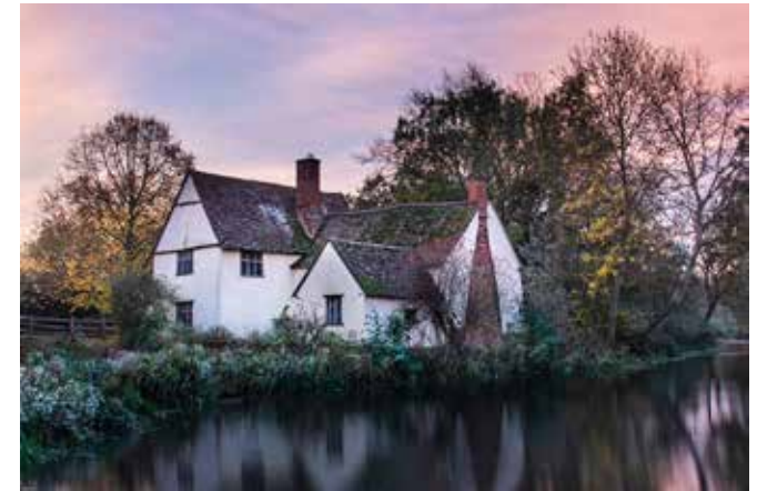
Right: 'Willy Lott's cottage' by Shaun Hykel CPAGB of Col- chester PS.