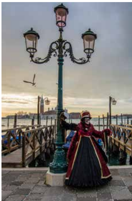
'Venice' by Sarah Toon LRPS ASICIP City Photo Club