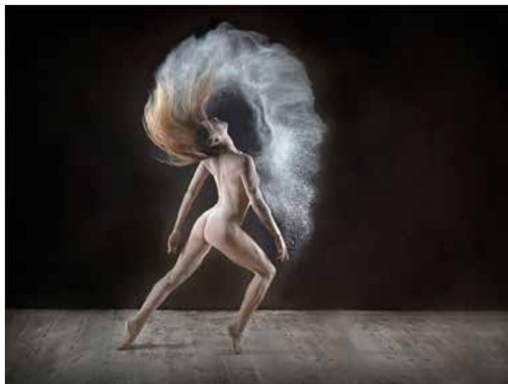
Best image of 2019 PDI Championship 'Flour Power' by Marcia Mellor of Beyond Group

Twenty-three clubs took part (29 last year) showing 15 images from each in Round 1. The top 10 clubs progressed to Round 2 and a further 10 images were shown. The judges