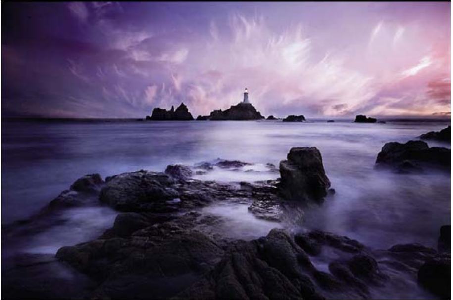
La Corbiere, Wispy end of the day