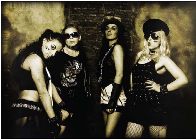
Rock Chicks