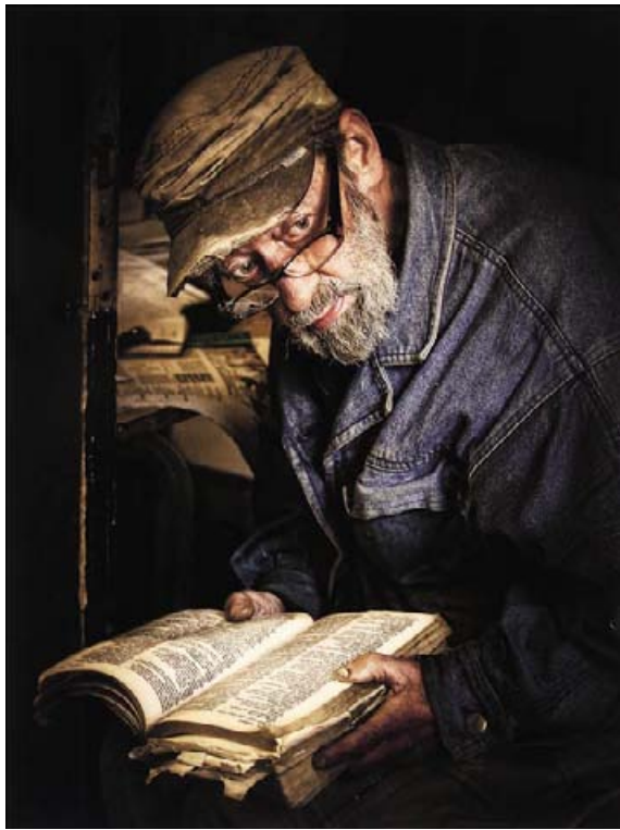
Crossword Puzzler by Norman Silver