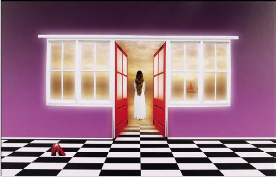
Best colour print - Ocean Scene by Malcolm Bumstead