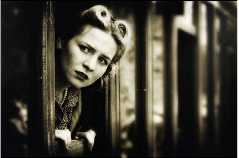
Brief Encounter by Nigel Northwood