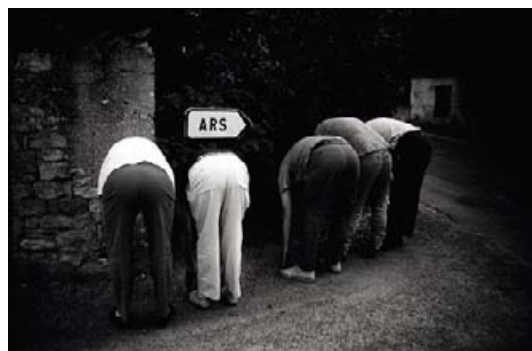
top - Early Morning, Essex middle - Kilchurn Castle bottom - French village of ARS