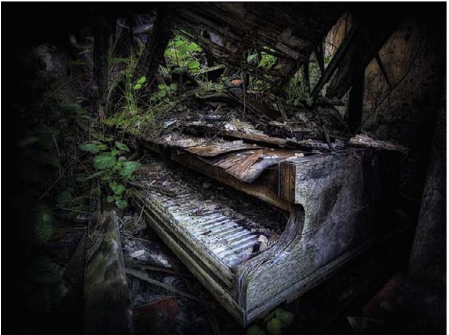
The Lost Cord by Ian Kippax