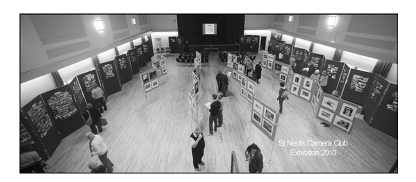
A view of St Neots Camera Club Annual Exhibition

Thus our well-informed and perceptive EAF Bulletin Reader when asked to judge Gorgeous Gertie, Hurricane Harriotte, and Indescribable Iris (not necessarily in the right order) understands immediately that this is the third competition of the season, while Zealous Zenobia tells you that it is the year after next. I kid you not!