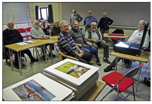
A view of the print judging room and the judges at the 2013 EAF Exhibition selection day.