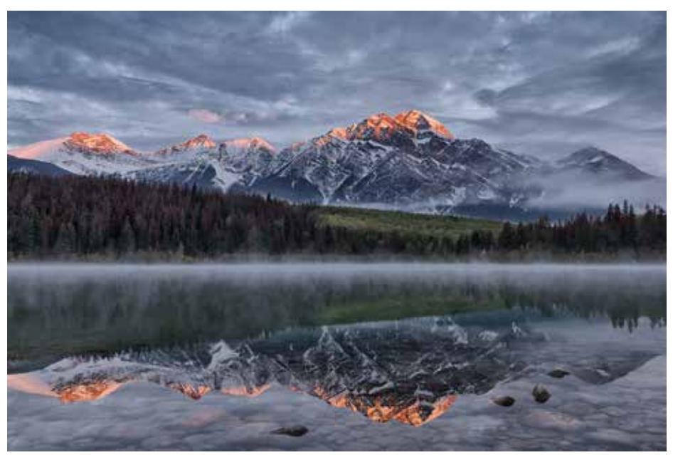
'Sunrise on Pyramid Mountain' by Dawn Osborn FRPS EFIAP/b DPAGB BPE5*.