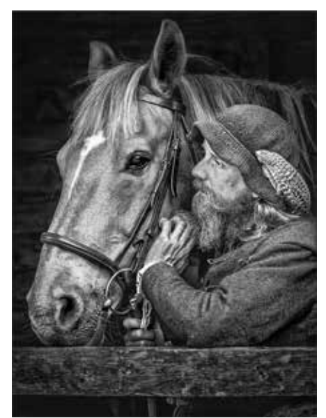
Companions'.