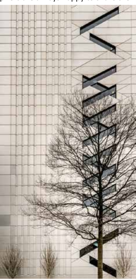
'Linear London' by Debbie Smyth.

Our aim is to help members on their photographic journey, irrespective of their starting point – encouraging everyone to improve their photographic knowledge and practice in a fun and welcoming environment. Our more experienced photographers are always happy to share their