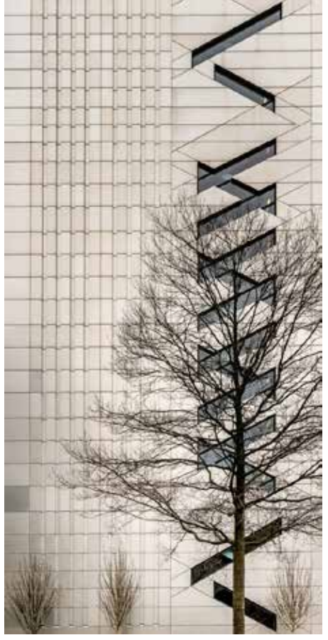
'Linear London' by Debbie Smyth.

Our aim is to help members on their photographic journey, irrespective of their starting point — encouraging everyone to improve their photographic knowledge and practice in a fun and welcoming environment. Our more experienced photographers are always happy to share their