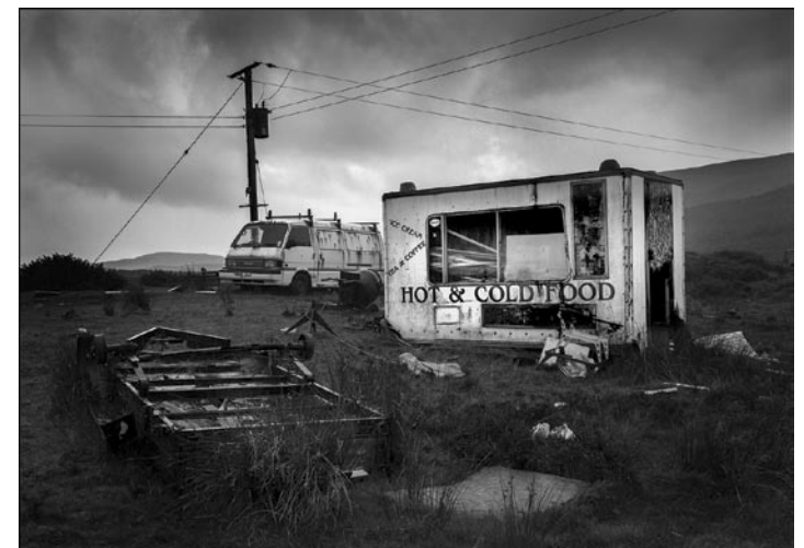
Refeshment Stop, Skye