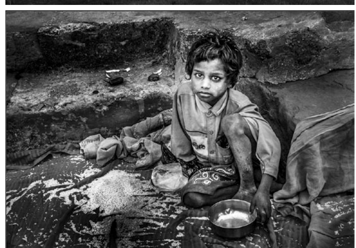
Beggar boy with rice, India