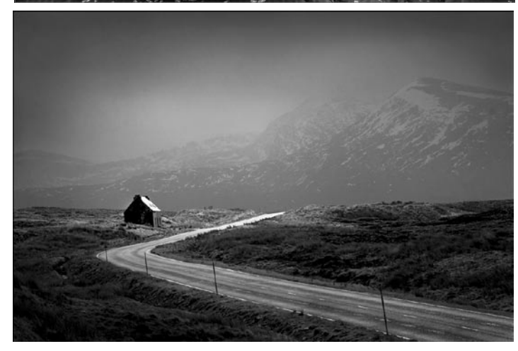
Destitution Road, Scotland