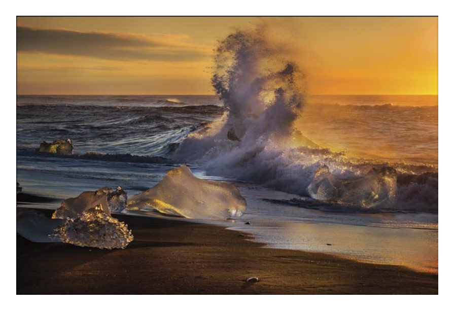
Sunrise at Jokulsarlon, Iceland