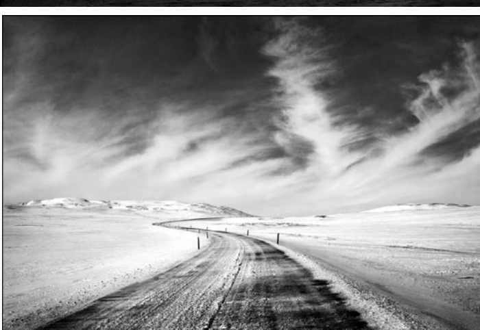
Lonely Road, Iceland