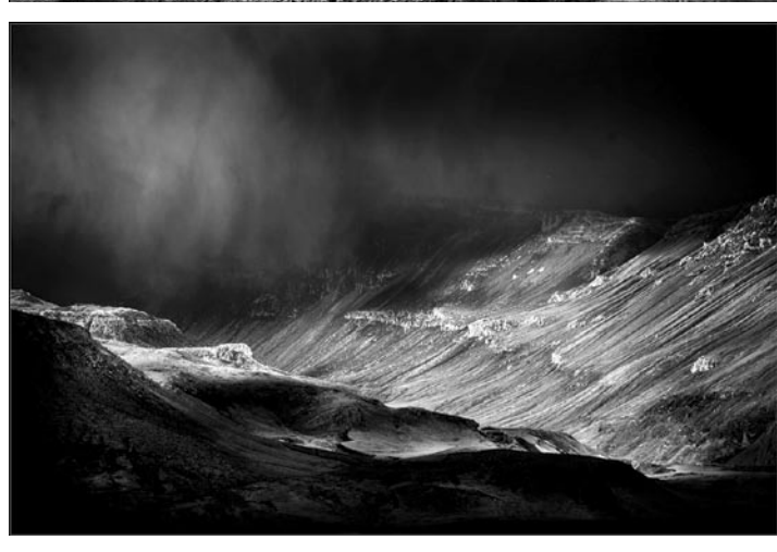
In the ash cloud, Iceland