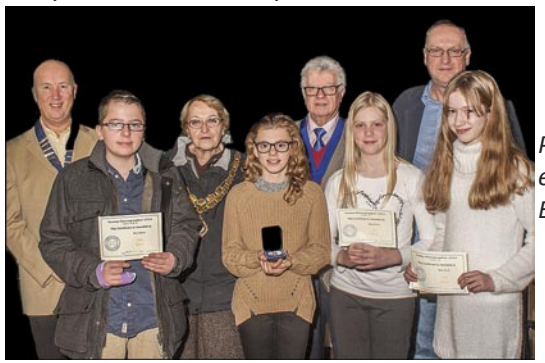
Photograph shows the winning entrants in the Ware PS Exhibition with their awards.