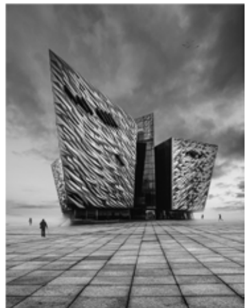
Bottom: 'The Titanic Experience' by Malcolm Bumstead of Ipswich & DPS.