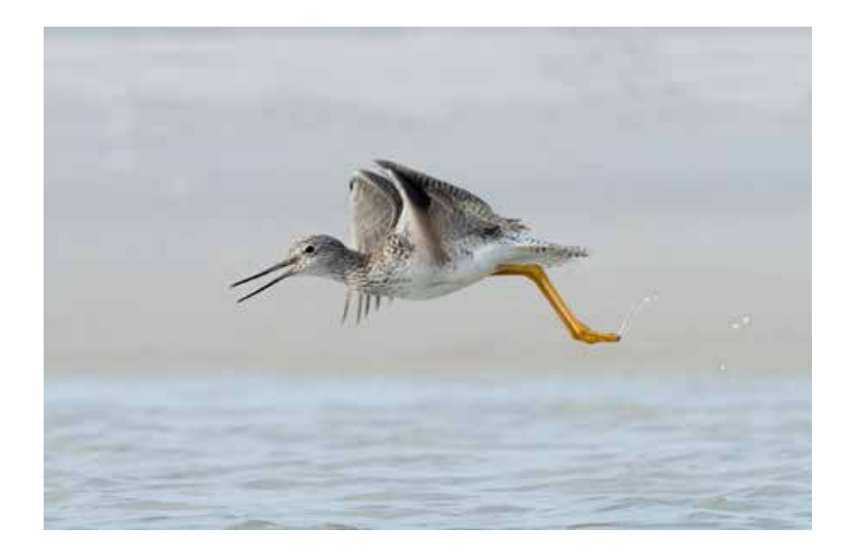
Below: 'Lesser Yellowlegs with water trail' by Judith Wells CPAGB of North Norfolk PS.