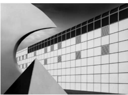
Left: 'The Salisbury Arts Centre' by Desmond King ARPS CPAGB of Buxton PC.