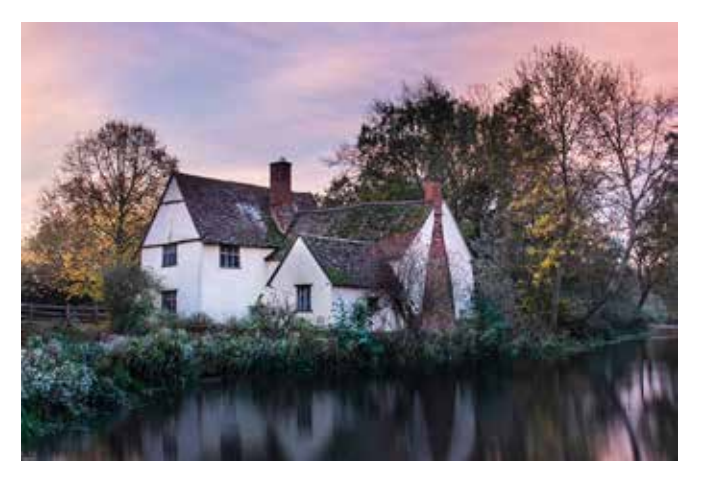
Right: 'Willy Lott's cottage' by Shaun Hykel CPAGB of Colchester PS.