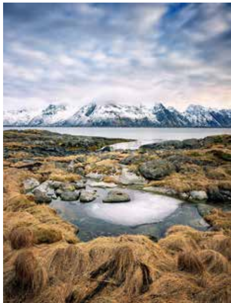
'Lofoten View' by Paul Giles AFIAP DPAGB.

who may benefit from the feedback score given at these events. We have decided to change this approach in 2025. When supporting the EAF events in the future each PICO member will submit images that will automatically be included in the