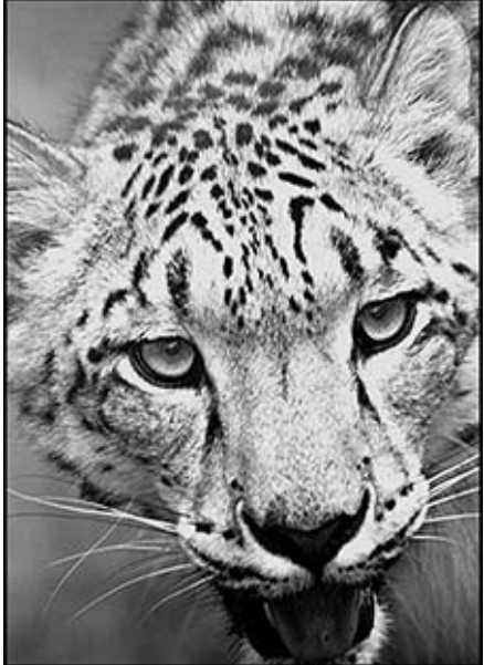
Snow Leopard

Another letter asks for opinions from EAF clubs regarding accepting young people as active members.