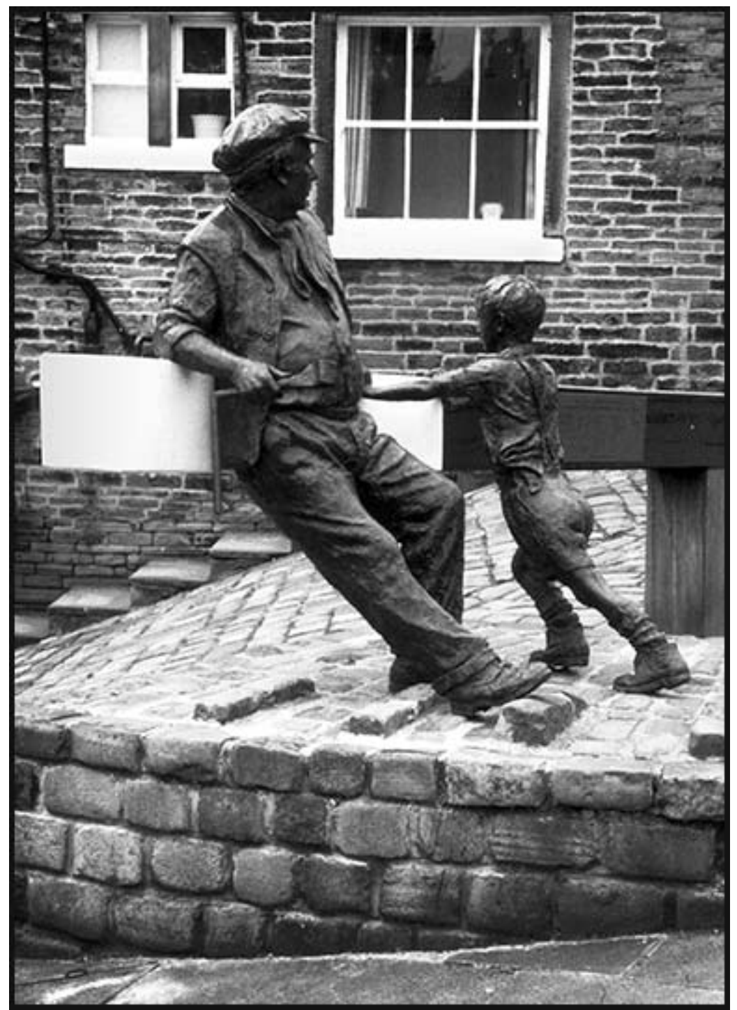
Sowerby Bridge by Stan Searle