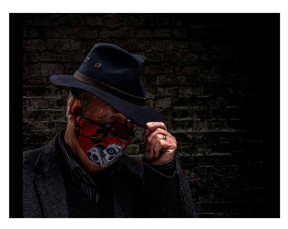
'More Precautions' by Ray Diamond of Thurrock CC