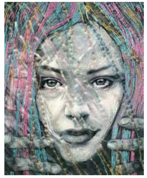
'Girl with the Unicorn Hair' by Chrissie Alexander of Colchester PS.

Editor's note: I often need good images to fill odd spaces in the Bulletin. If you'd like one of your images featured please let me have three or four images, preferably in portrait format.