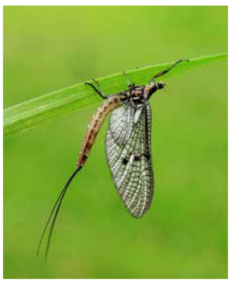
'Mayfly' by Judy Leak of Lowestoft PC.

formed. However, in May 2000 the clubs merged back and the club was renamed 'The Lowestoft Photographic and Digital Imaging Club'. However, there was animated discussion as to whether digital images could be classed as photographs. Luckily this did not last long, but for a while the schisms which digital images created caused breakaway groups to be formed. In the end, they all returned into the fold as 'The Lowestoft Photographic Club' over a decade ago. Around the time of the merger in 2000, large numbers of members submitted themselves to the Fast Anglian Federation Judging Courses. For several years afterwards, the club had the greatest number of judges in the Federation, including several at the highest level.