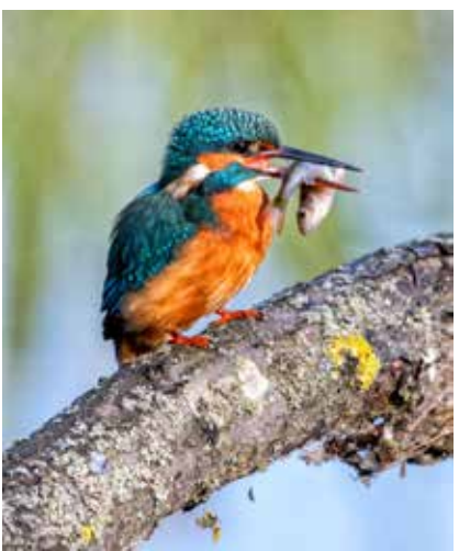
'Fresh Sushi' by David Leuty of Lowestoft PC - see page 12.