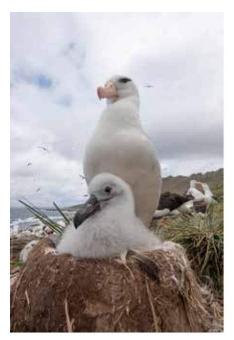
'Black Browed Albatross with chick' by Robin Claydon ARPS DPAGB BPE3*.

the whole of what is now the Hertford Theatre when it opened in 1979. Our members were among the early adopters of digital cameras and processing and 35mm slide competitions soon became a thing of the past. In 1982, one of our members started another club in the neighbouring town of Hoddesdon, which continues to this day.