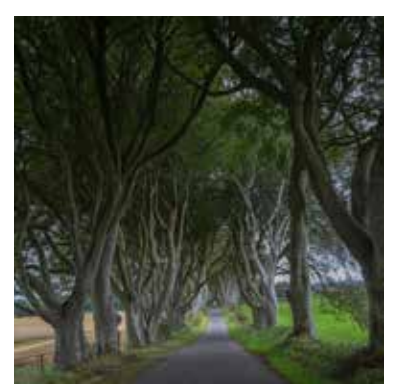
'Dark Hedges' by Peter Fiddeman of Hertford & DCC - see page 14.