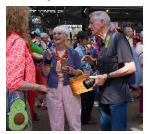
'Club visit to the London Colour Walk' by Peter Fiddeman.

From the 1970s to the 90s we had enthusiastic AV workers, using slide projectors and dissolve units, and the club's big public AV show 'Colour in Camera' ran from 1977 to 1991 – we were among the first to hire and fill